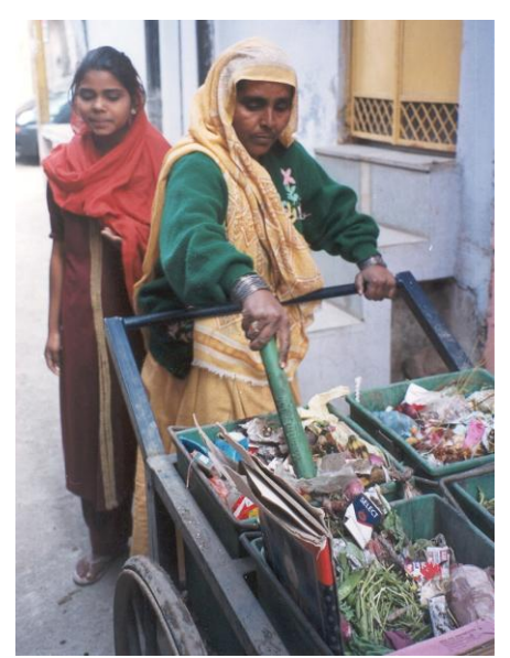
Photo 1: Door-to-door solid waste collector in Delhi

Waste is generated by a range of stakeholders including: pedestrians, households, businesses, markets, industries and healthcare facilities. Therefore solid waste can also include toxic waste (e.g. chemicals from industry), biological waste (e.g. dressings from hospitals) and occasionally faeces (e.g. from nappies). These hazardous wastes require specialised treatment and disposal, not discussed in this technical brief. The source of waste often determines its quantities and characteristics. In developing countries waste generated from various sources is often combined at collection and disposal, so due care must always be taken to ensure the health and safety of those involved in waste management.