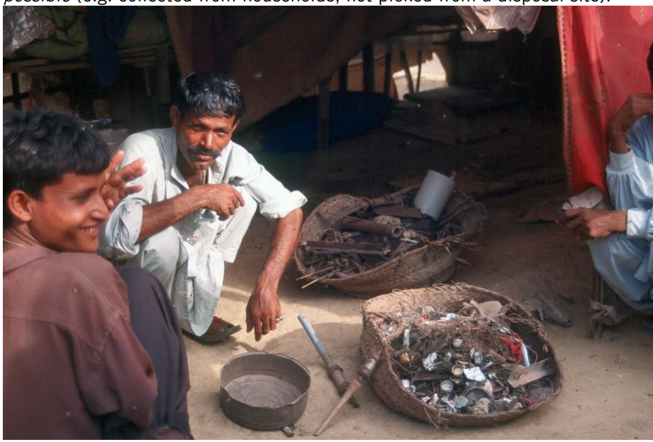
Photo 2: Recyclable materials dealer in Pakistan (Jonathan Rouse).

Many cities have active recycling sectors. This is predominantly an informal-sector activity, and can provide employment for tens of thousands of urban poor in a single city (photograph 2). Where the sector is particularly well developed, influential businessmen may have vested interests in retaining control. Efforts of SWM planners may be best directed at regulation and support: for example ensuring recycling workers are properly protected from health and safety risks, and that businesses access recyclable materials as close to the point of generation as possible (e.g. collected from households, not picked from a disposal site).